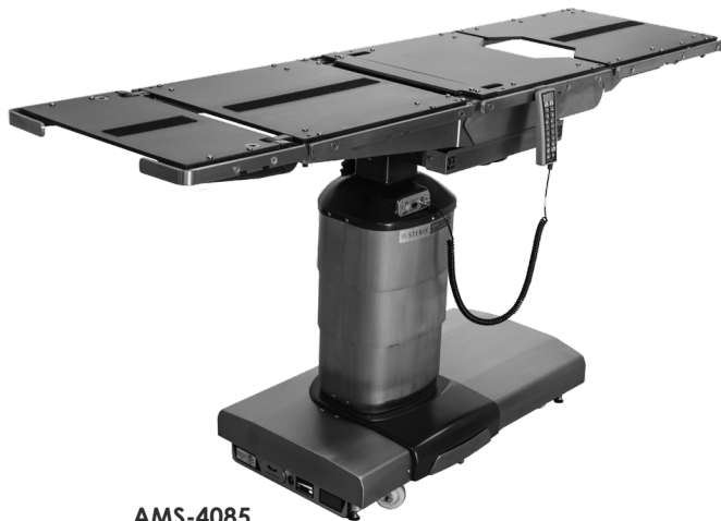
AMS-4085 General Surgical Table Remanufactured through ReVive by Bryton Corp. (Shown w/X-Ray Tops - Not included)